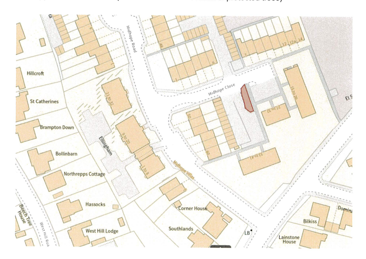
Appendix 2 – Site Plan (Red area indicates location of protected trees)